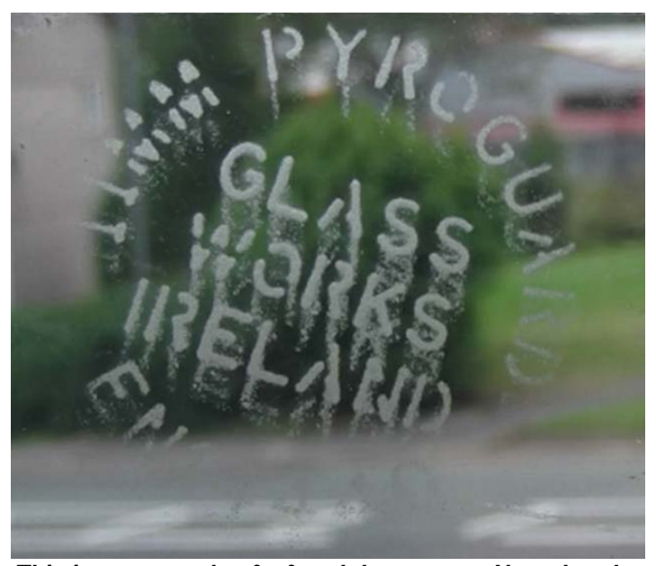
This is an example of a fraudulent stamp. Note that the supplier's name is in the middle.

Glass which has been identified as counterfeit has been marked with a stamp similar to one shown below. Also see the appendix for an official statement from CGI International and further photos of the legitimate and counterfeit products.