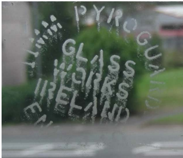
This is an example of a fraudulent stamp. Note that the supplier's name is in the middle.

Glass which has been identified as counterfeit has been marked with a stamp similar to one shown below. Also see the appendix for an official statement from CGI International and further photos of the legitimate and counterfeit products.